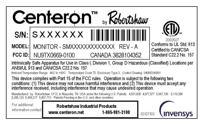
Figure 1: Monitor Label Product Markings

Included on the housing of the Monitor are labels that contain important information about the product.